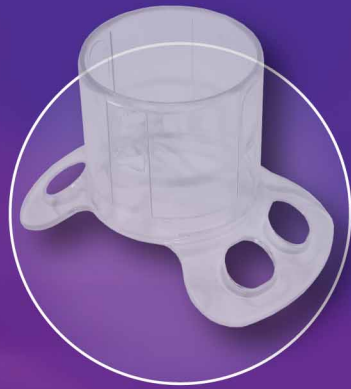
Clear Butterfly Anal Dilator