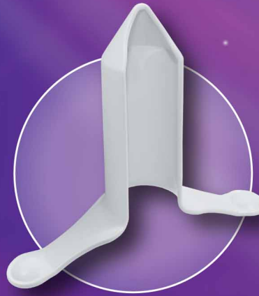
Purse-String Suture Anoscope