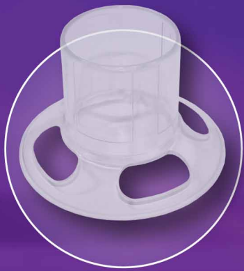
Clear Circular Anal Dilator

The Ultimate Haemorrhoidal Circular Stapler is supplied with the following 5 accessories: