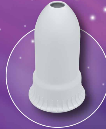
Anal Dilator Obturator